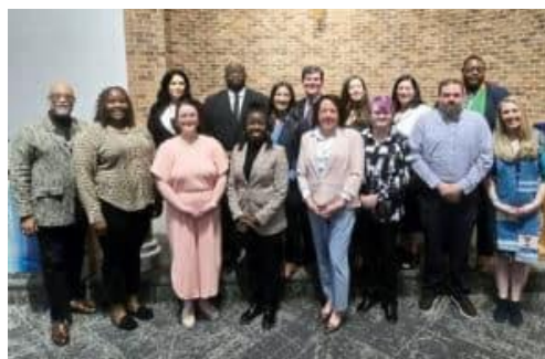
The 2026 Nollau class of diakonal ministers after the service.

For participants at this year's ecumenical The Gathering: Many Gifts, One Spirit , the event was a three-day, spirit-filled opportunity to form bonds and partnerships with colleagues from other health and human service ministries. Held March 24-26, 2026, in Indianapolis, The Gathering drew almost 500 people from Mennonite, Methodist, Presbyterian, Quaker, and United Church of Christ agencies and their partner organizations. Read