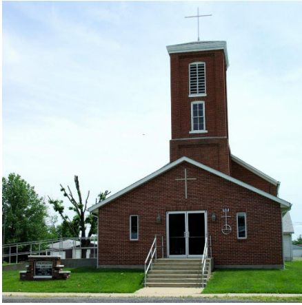
Friedens UCC, Hecker