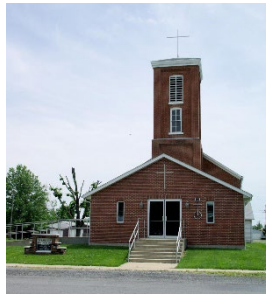
Hecker Friedens UCC