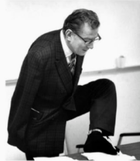
Without his efforts and that of our disability rights ancestors, there would be no ADA.