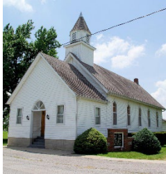
-DuBois St. Mark's UCC