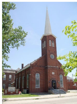
-Breese St. John's UCC