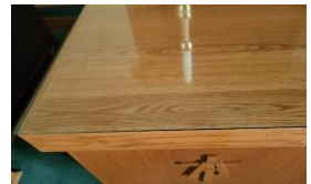
(Left) Children's altar 4'1" height 25" wide 6-feet long (Second from left) Communion table 35 ½ inches tall 25 inches wide 6-feet long The Bibles on top are German, various years, and offering plates (Two right photos) Communion table used in the Sanctuary, has a removable glass covering. 7-feet long, 3 feet-3 ½ inches tall