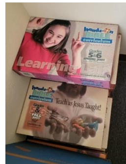
(Left) Hymn number display with numbers included (Second & third from left) Choir robes – blue with reversible stoles – 15 robes in various sizes (Right) Children classroom studies & hands-on Bible curriculum