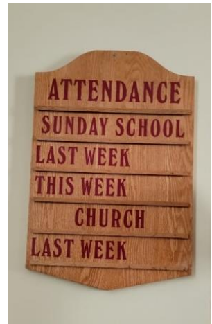
(Left) Baptismal Font – very heavy (Second and third from left) Altar candles – wax outside/interior spring 26 Inches tall 2 candles (Second from right) Plastic chairs - adult and children sizes (Far right) Attendance board with numbers included