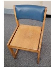
(Left) Children pews – 3 pews - full length (Right) 12 Chairs - Used in teenage classroom