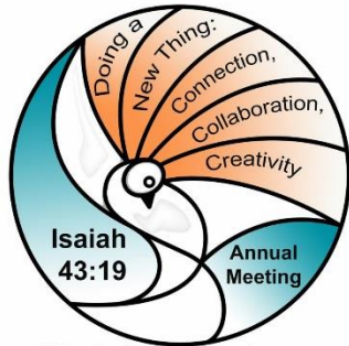
Illinois South Conference October 21, 2023 St. Peter's UCC, Red Bud, IL

Pastors Lay Delegates Visitors & Youth SAVE THE DATE