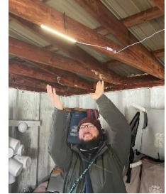
photo is a portable, folding solar panel and right is the light it feeds). The people participating

On Saturday, March 25, a small but mighty work crew came out for a Green DuBois workday. Several members cut down invasive brush and others set up a small solar light system at the boathouse (top left