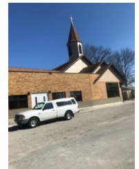
Old church.....New church