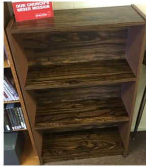
2 - Wooden shelves: 39.5" x 24.5" x 9.5" There are two of these.