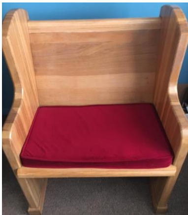
2 - small pews (from Fayetteville Friedens)