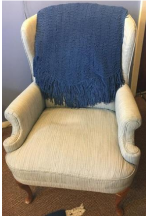
2 - Wing-backed bluish chairs