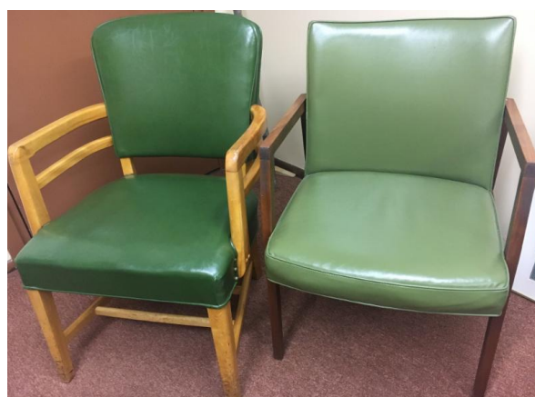
2 - green chairs