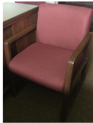
3 - Maroon waiting chair with arms