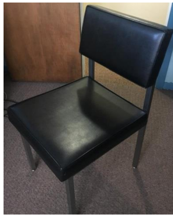
1 - Black waiting chair