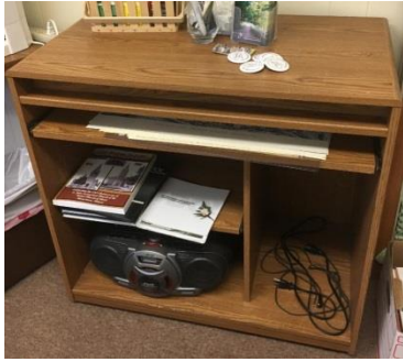
1 - Computer Table 34.5" x 33" x 20" - Items on desk not included.