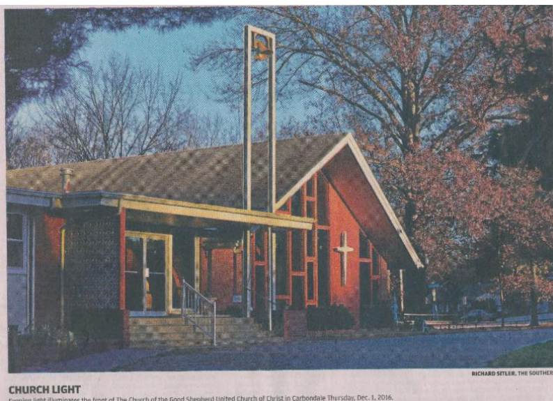
CHURCH LIGHT Evening light illuminates the front of The Church of the Good Shepherd United Church of Christ in Carbondale Thursday, Dec. 1, 2016.