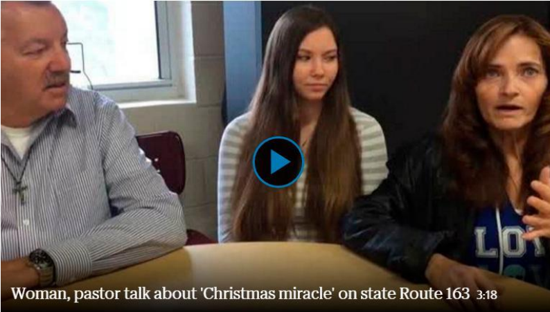
Woman, pastor talk about 'Christmas miracle' on state Route 163 3:18

There was more to the story of Concordia UCC's generosity during the ice storm recently. Belleville News Democrat shared it first and UCC put it in their newsletter, KYP (Keeping You Posted). See the video and the article from BND here .