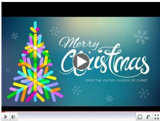
Greetings from UCC