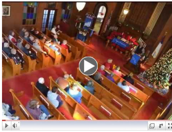
Region 2 Advent Pilgrimage Progressive Dinner #2